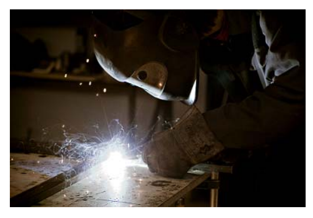
Dovile Cizaite - Entry to the EU-OSHA photo competition 2009