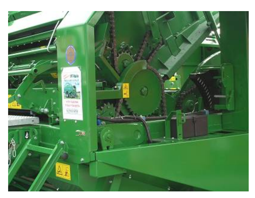
Chains of a roller baler, safety signs in place