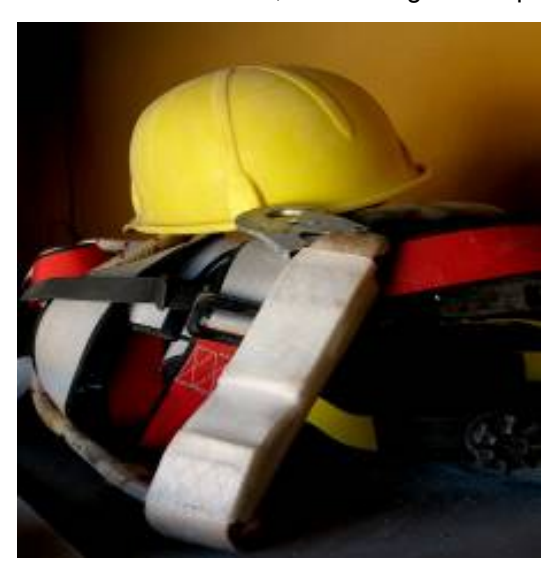
Cecilia Ricciardi – Entry to the EU-OSHA photo competition 2009 -"What's your image of safety & health at work?

PPE has to be suitable for the work and conditions, and must give adequate protection.